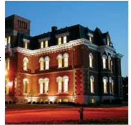
The front portion of our Headquarters building in Xenia. It's a beautiful place!